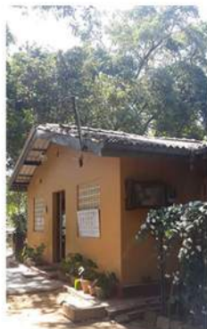
Quarters for other abused women