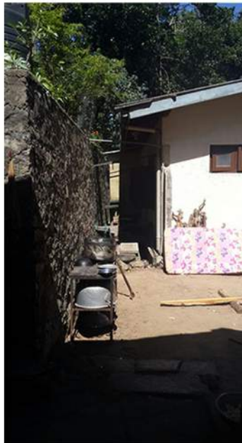
Courtyard for drying pots