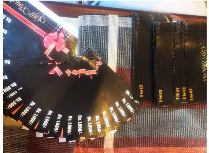
DSI Vouchers (Rs. 22,000.00) for school shoes and socks