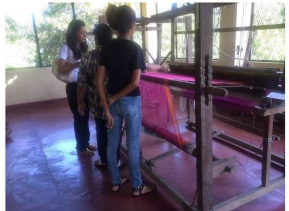
Visiting and spending the morning with the women at the WDC Centre in Kandy