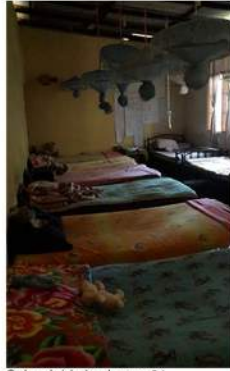
Schoolgirls bedroom 01