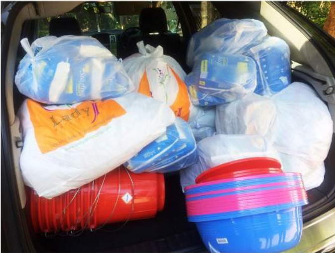
Purchased items ready to be delivered to the Centre in Kandy