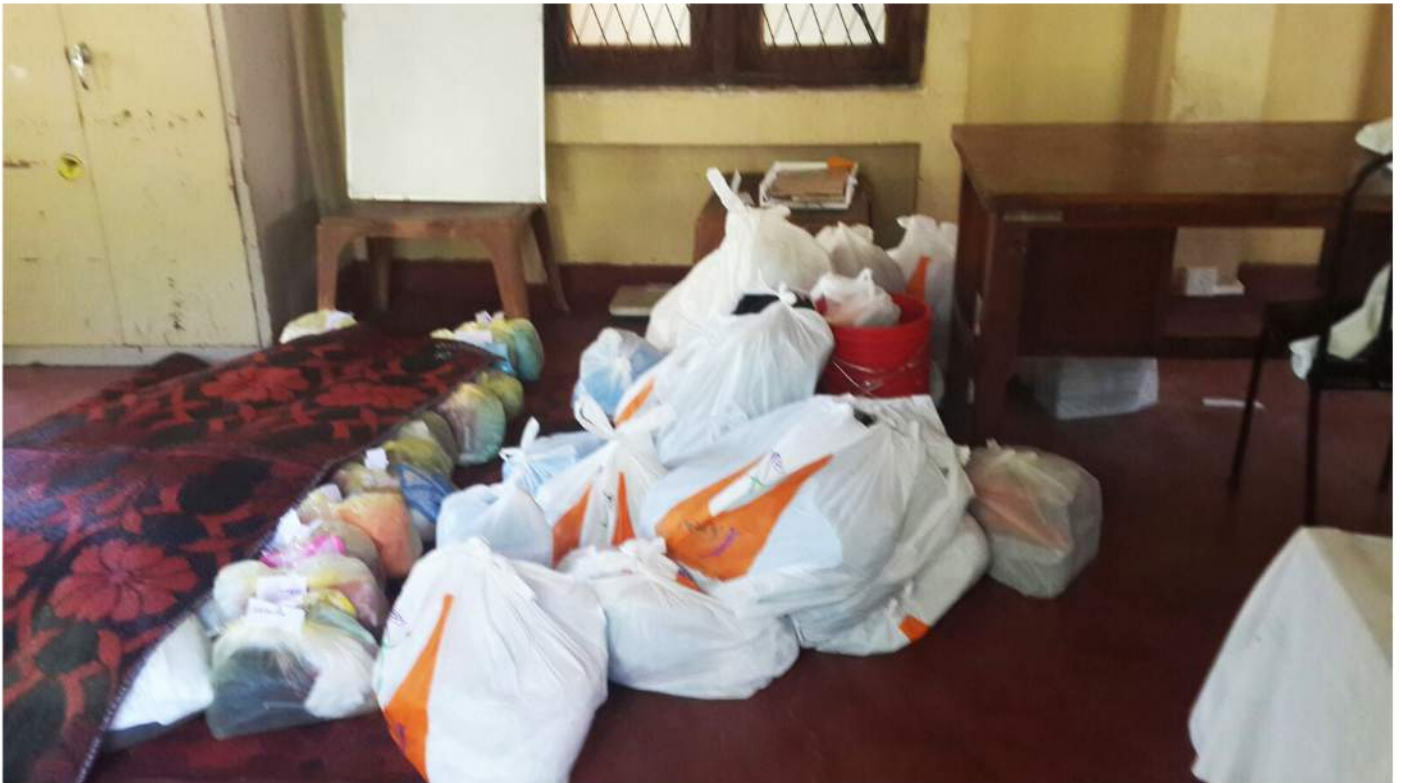
Purchased items delivered to the WDC Centre in Kandy