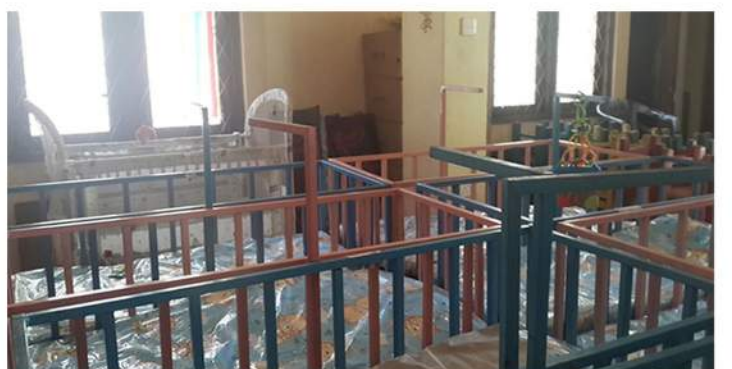
Cots for the Babies